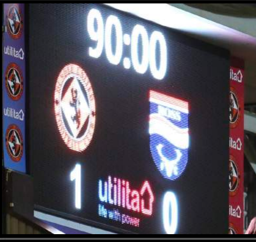
Big screen adverts £3500 - 4 adverts per match